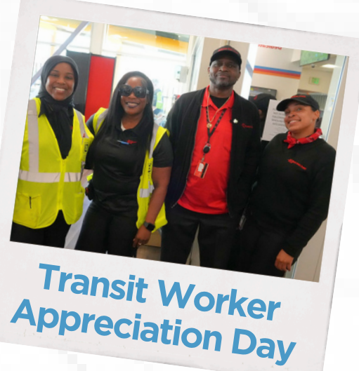
Transit Worker Appreciation Day