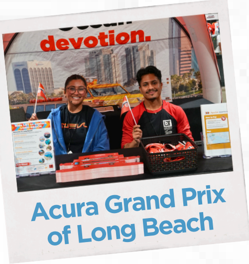
Acura Grand Prix of Long Beach