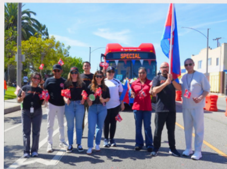
Cambodia Town Parade