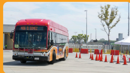
Regional Five Star Roadeo