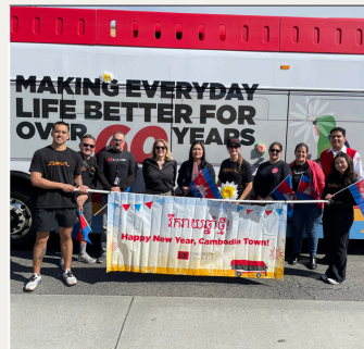
Cambodia Town Parade