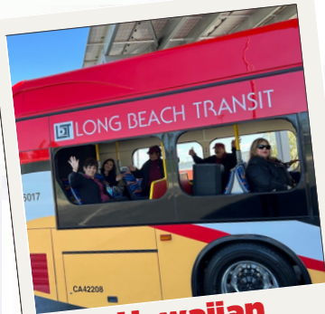
Hawaiian Gardens Parade