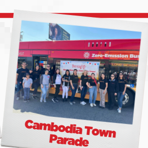
Cambodia Town Parade